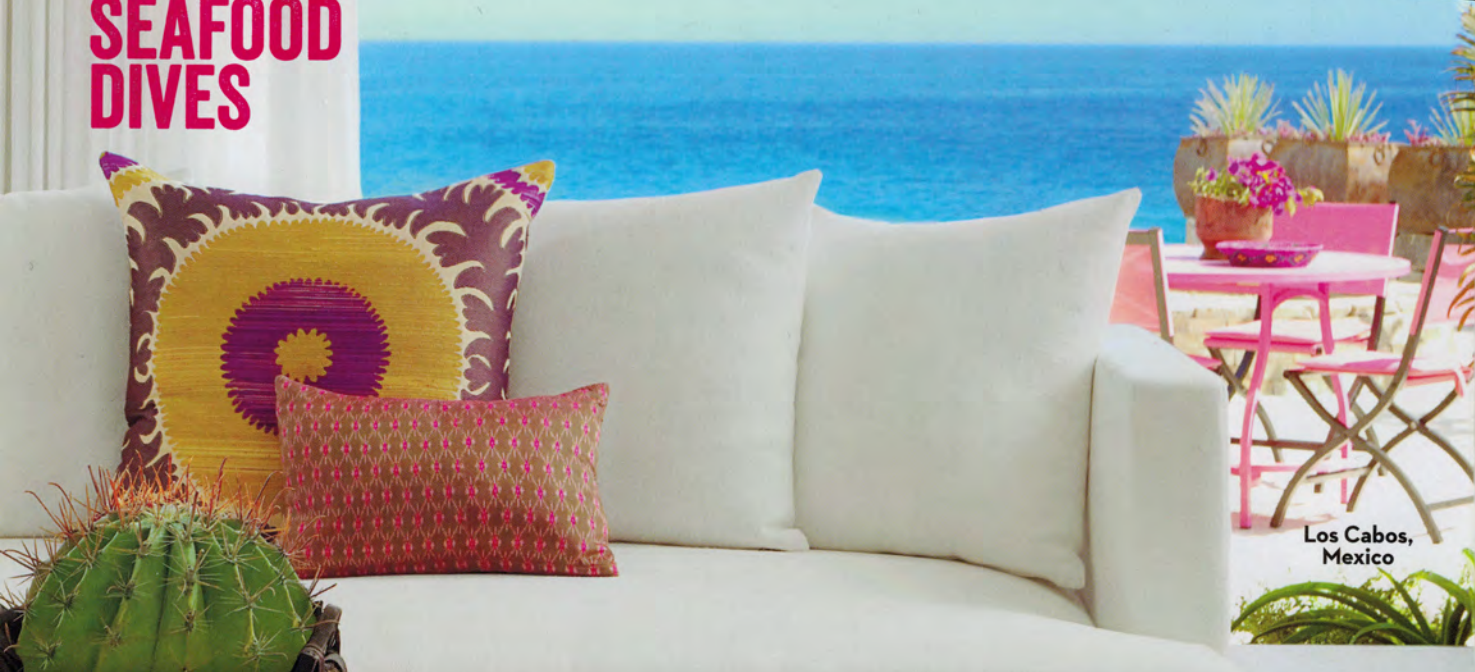
Los Cabos, Mexico