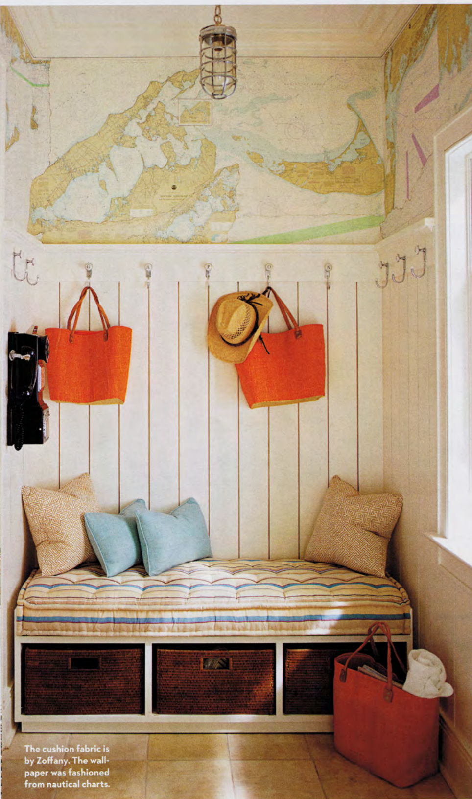
The cushion fabric is by Zoffany. The wall-paper was fashioned from nautical charts.

Near the water, Mendelson takes into account a home’s environs. “There are inherent attitudes in locations. Designing in the Hamptons is a little bit more laid-back, with beautiful lawns and charming fisherman’s villages. Then you go to Miami and it’s a different vibe,” he says. “It’s an escape, a sense of vacation.” —Brooke Showell ▶