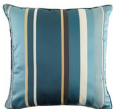
Stripe Pillow, $15, Pier 1 Imports