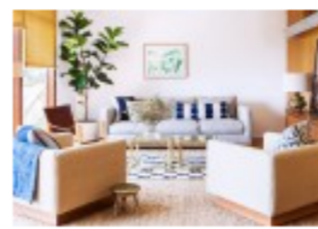
BEFORE AND AFTER: NEW LIFE FOR A MIDCENTURY JAPANESE LIVING ROOM January 29, 2014