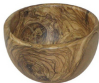
Berard Handcrafted Fruit Bowl, $250, Casa