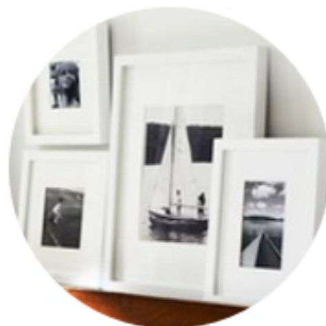
Wood Gallery Picture Frame, From $16, Pottery Barn