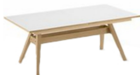
Skovby Table, $1860, Smart Furniture