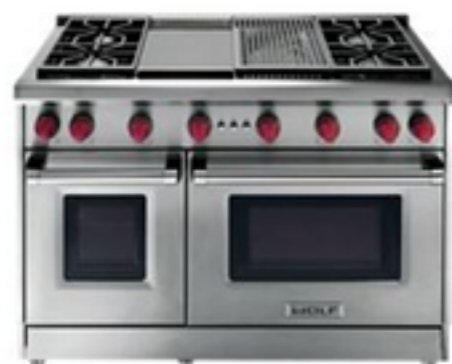
48" Gas Range, From $9325, Wolf