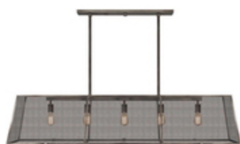
801740 Pendant, Price Upon Request, Brand Lighting