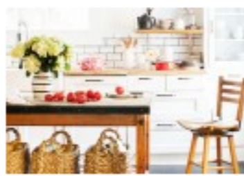
BEFORE AND AFTER: A RENOVATED PENNSYLVANIA SCHOOLHOUSE December 2, 2013