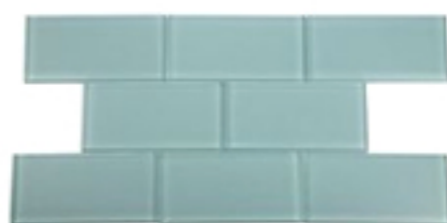
Loft Blue Gray Polished Tile, $15, Glass Tile Store