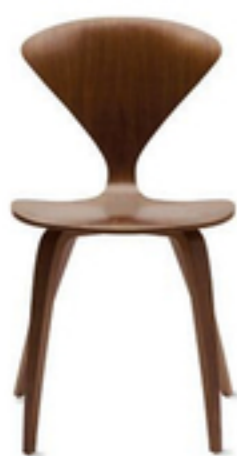
Cherner Side Chair, $749, DWR