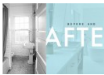
BEFORE AND AFTER: MINIMAL BATHING BEAUTY July 24, 2013