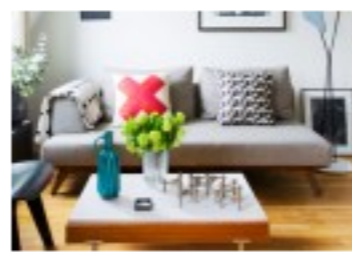
A DECORATOR'S OWN RETRO-INSPIRED PARISIAN PAD February 3, 2014