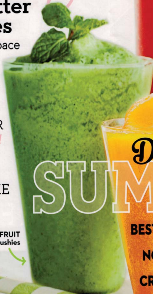
FRESH FRUIT Slushies