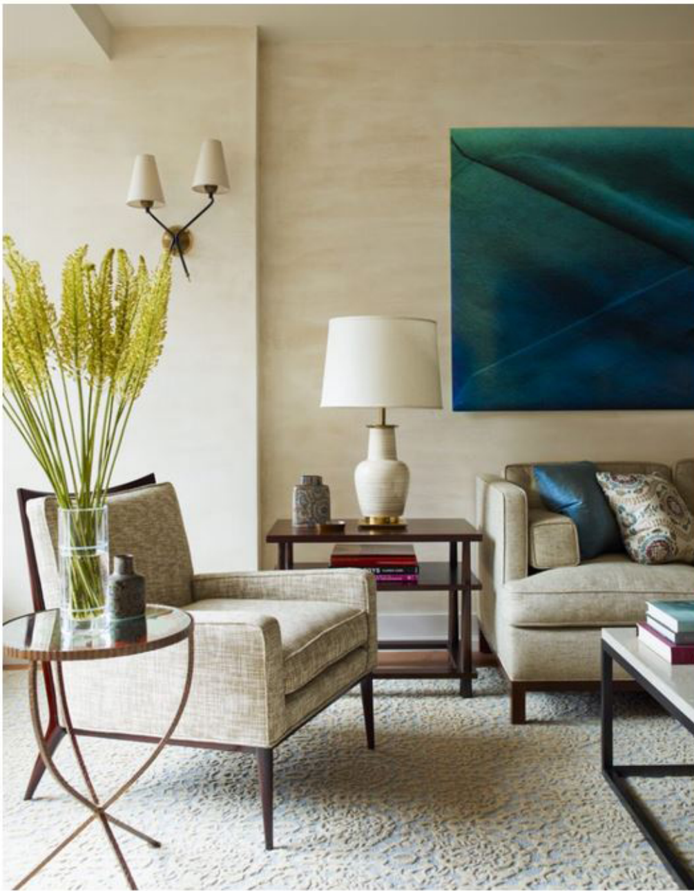
"The venetian plaster in the living room resembles the texture of a birch tree."