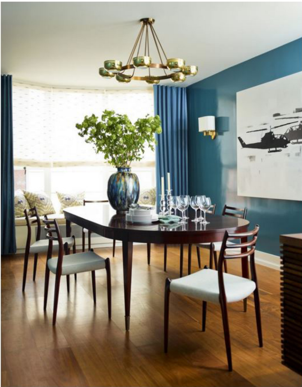
"The lacquered walls in the dining room add sophistication and sparkle."