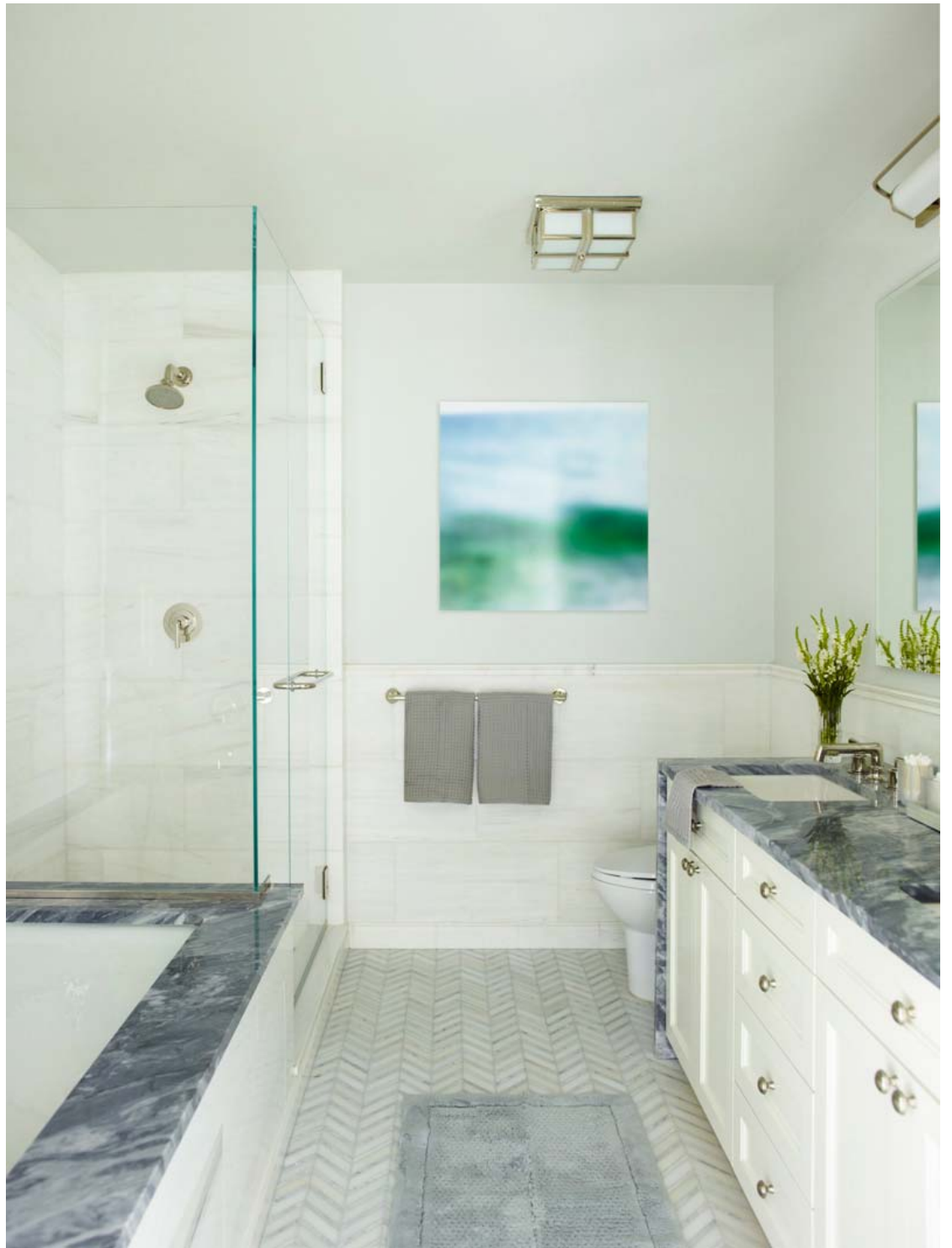
Even in this calm bathroom, Gideon adds a punch of color with abstract artwork.