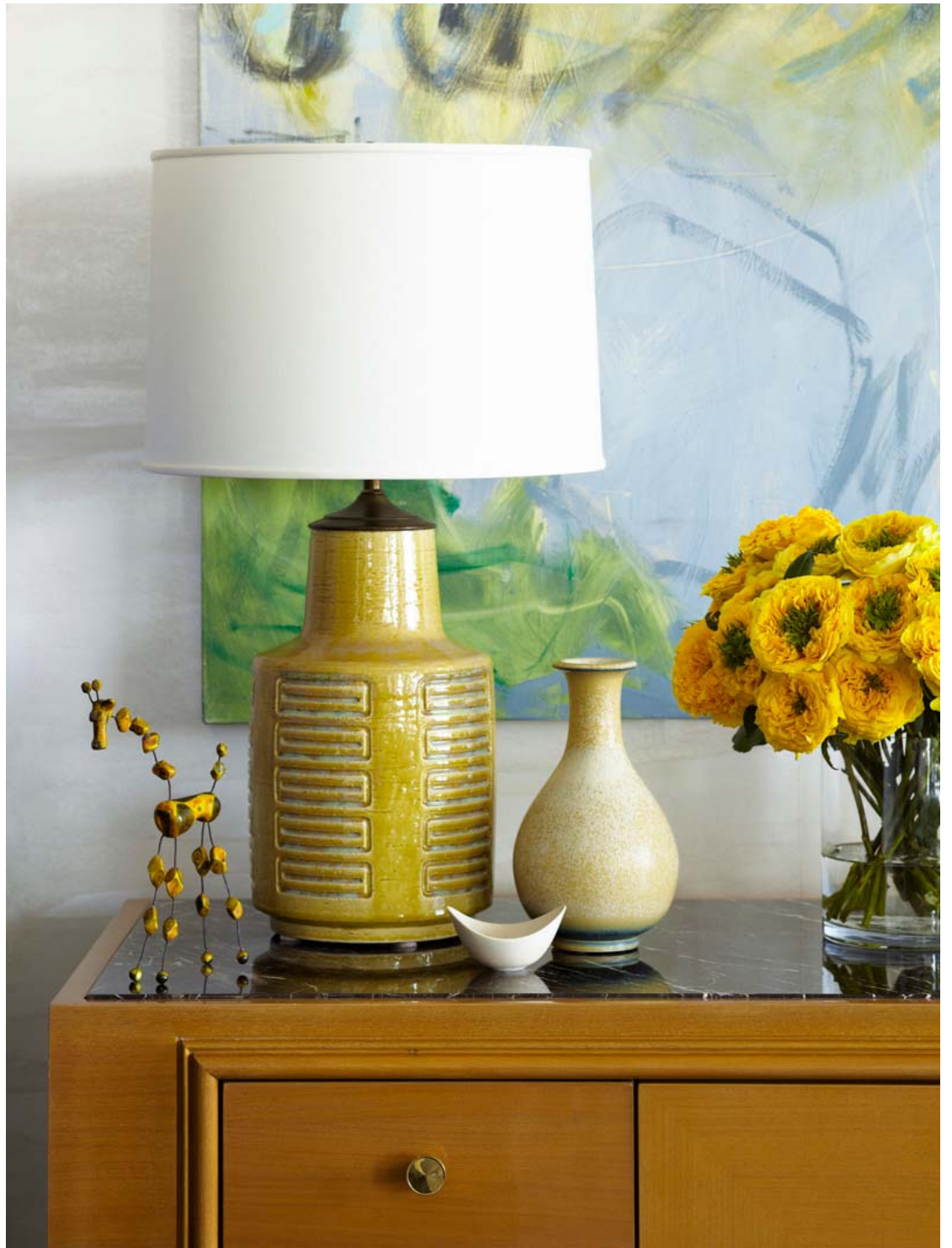
Custom Buffet by Mendelson Group fabricated by Attinello Furniture