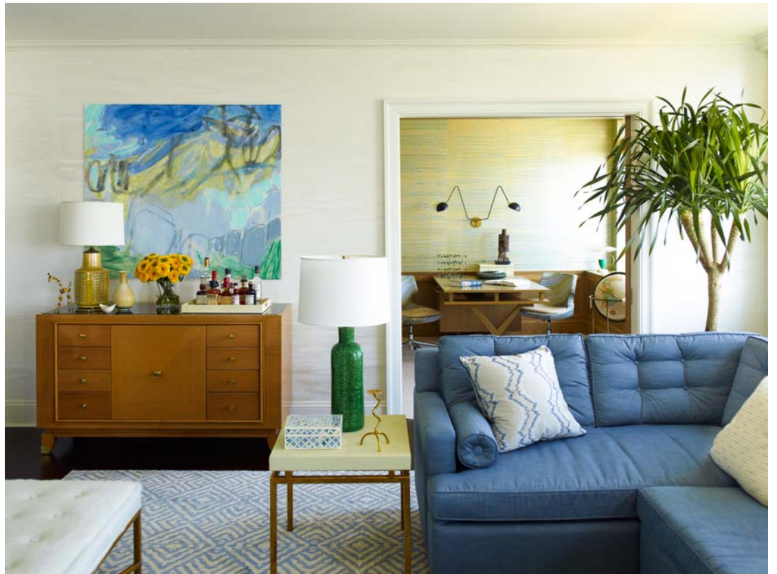
Custom Sofa by Avery Boardman | Custom Silk Area Rug by Sprung and Rich | Mahogany Cocktail Table by T.H. Robsjohn-Gibbings from Irwin Feld | Vintage Bitossi Ceramic Table Lamps from 1stDibs